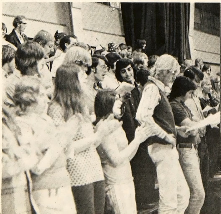
And the fans go crazy...