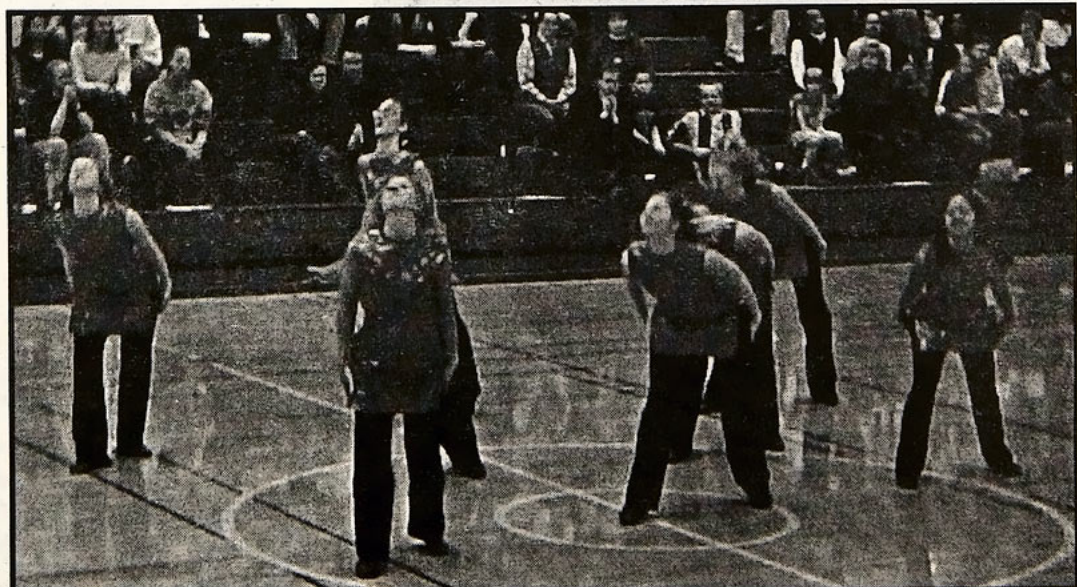
The Concordia Dance Team performs at the halftime of a CSP basketball game at CIT.