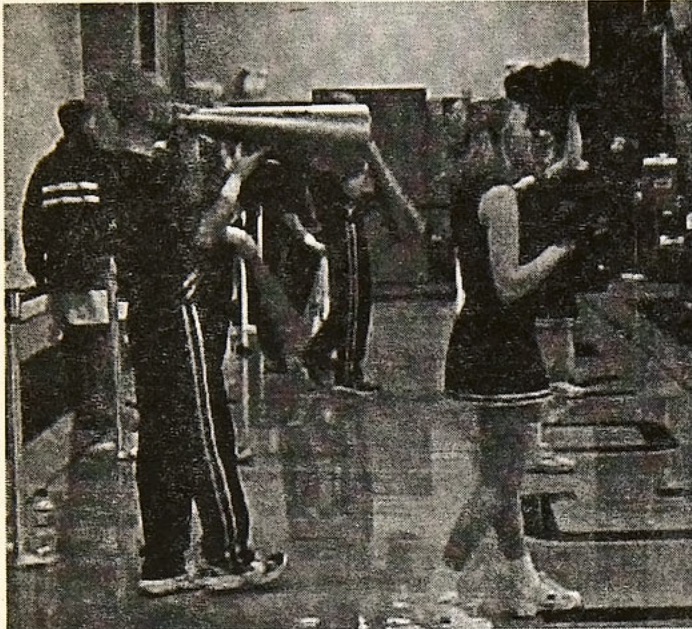
The Concordia Cheer Team travelled to River Forest for CIT at the end of January. Here, they stand on the sidelines to help cheer CSP on to a victory.