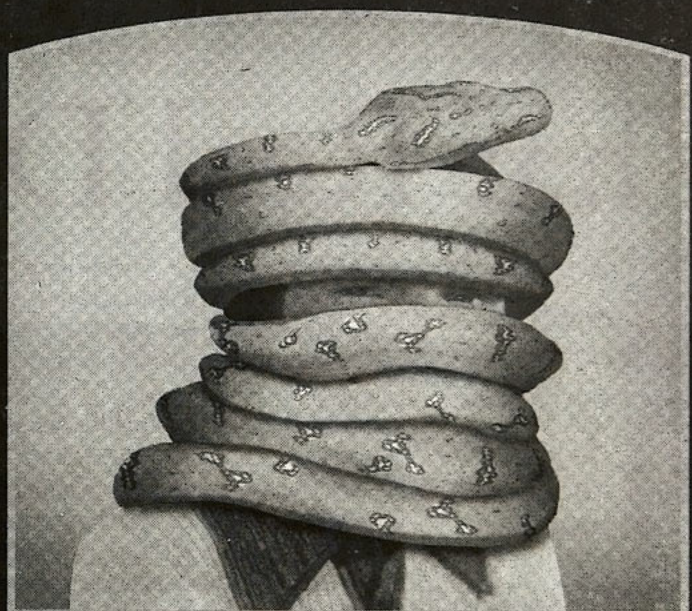
"Oh, that. Not to worry — It's just a python."