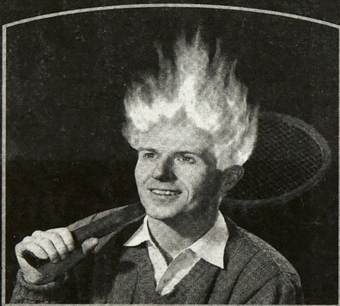
"Smoke? I don't smell anything."