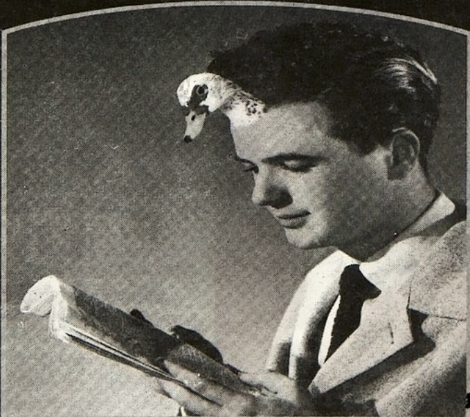
"I've been swimming in that pond by the reactor for years. It's harmless."