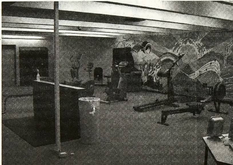
The Bear Den as we once knew it.

availability of workout equipment in the Bear Den, and set out to develop a proposal for a new remodeled Bear Den.