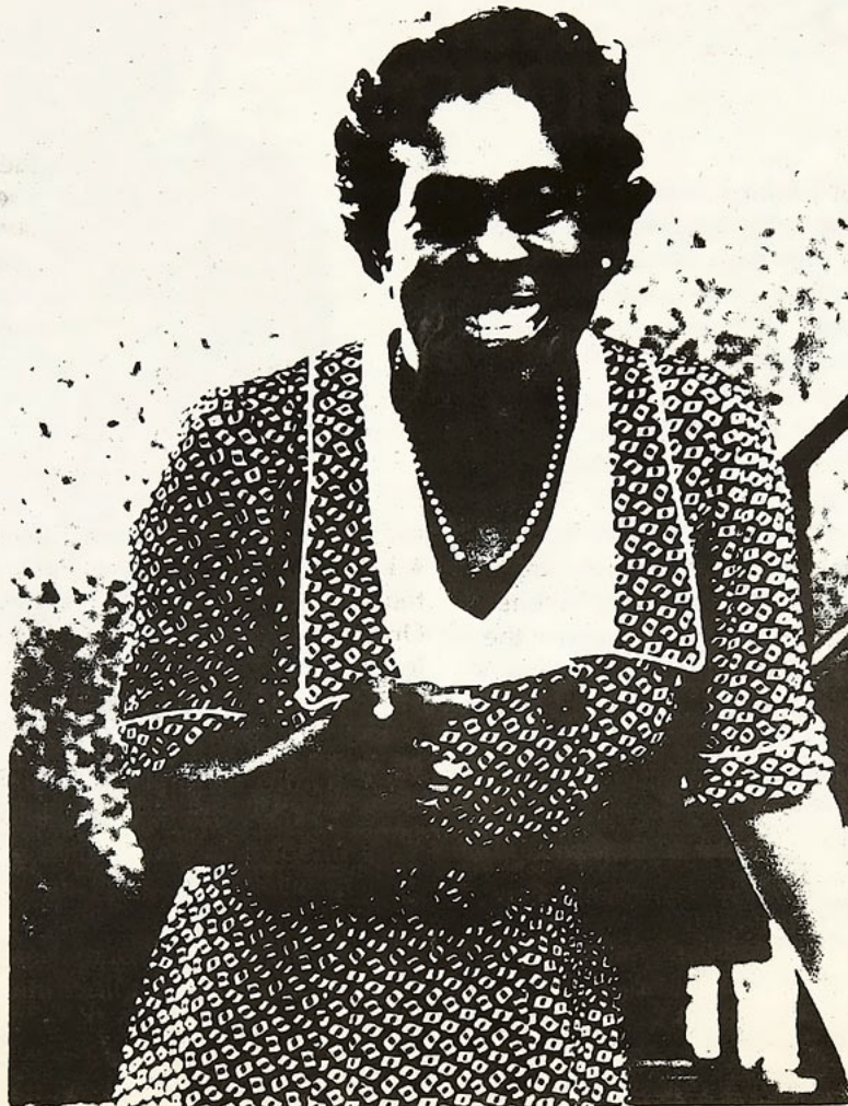
THE PIANO LESSON Comes Home

Ticket prices are $16 to $38 (student rush, $8.00).