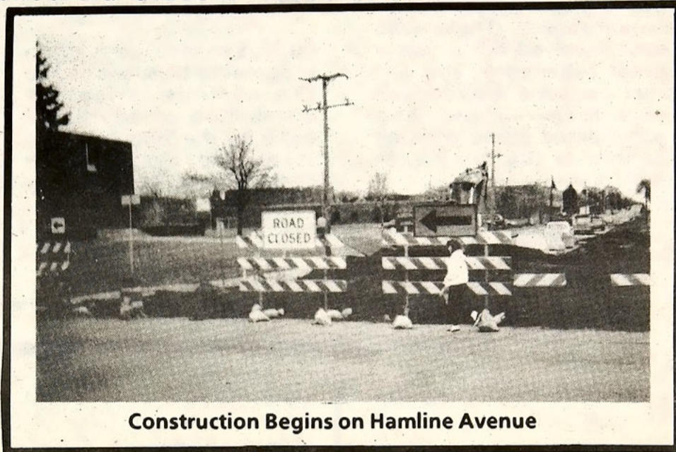
Construction Begins on Hamline Avenue