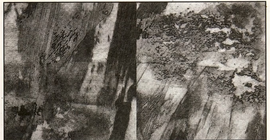
Dry Land Series 2

importance that I think art can play in re-framing my relationship with nature," said Hagstrom.