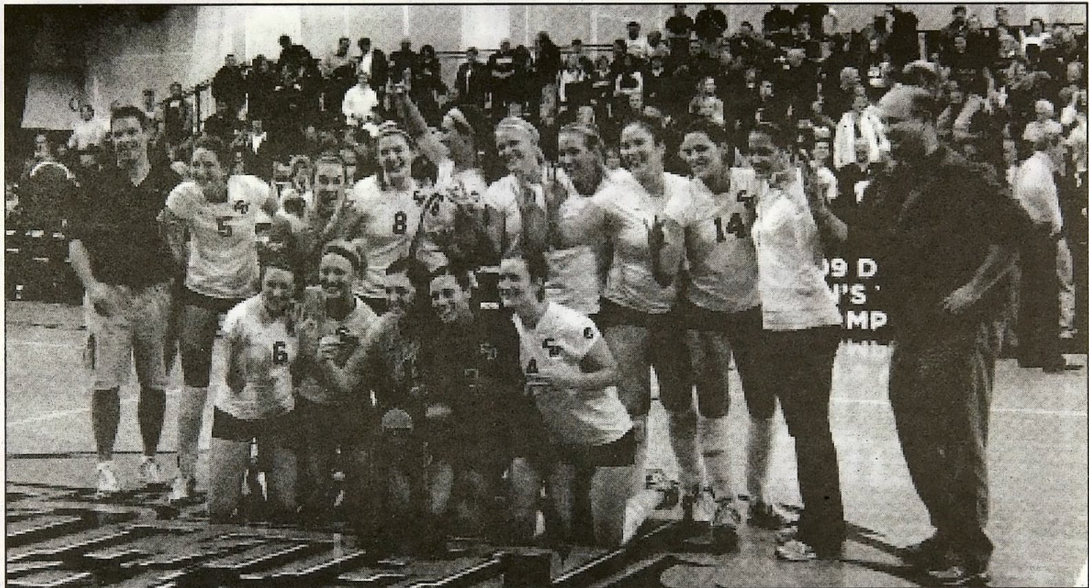
The team right after they won their final game to conquer their third National Championship.