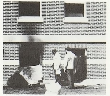
Concordia College, St. Paul, Classroom Building Fire, April 14-15, 1972 - Exterior View of Fire Location.

Damage costs are estimated between $35,000 and $50,000. Two small classrooms on the third floor have been temporarily rendered unusable. Two professional offices on the second floor and the basement City Student Room will need extensive repair before approved for use. The entire classroom building will require cleaning from smoke and water damage. Source of the fire is unknown.