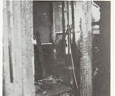
Concordia College, St. Paul, Classroom Building Fire, April 14-15, 1972 - Source of Fire - Janitorial Supply Room of Basement.