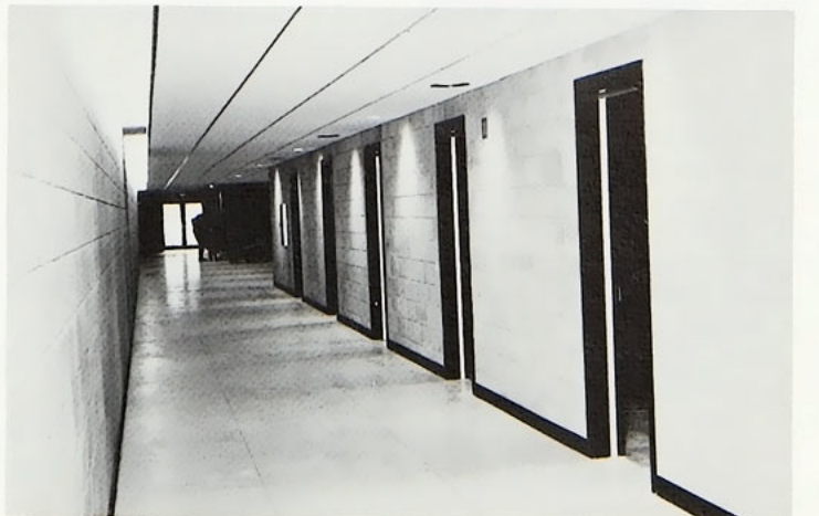
Interior of Concordia College Music Classroom Building, April 11, 1972. Future Professorial Offices.